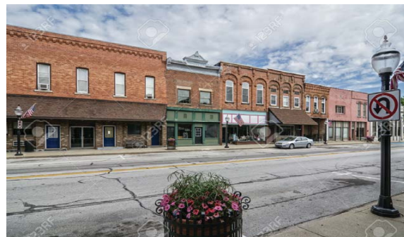
Rural Town Context